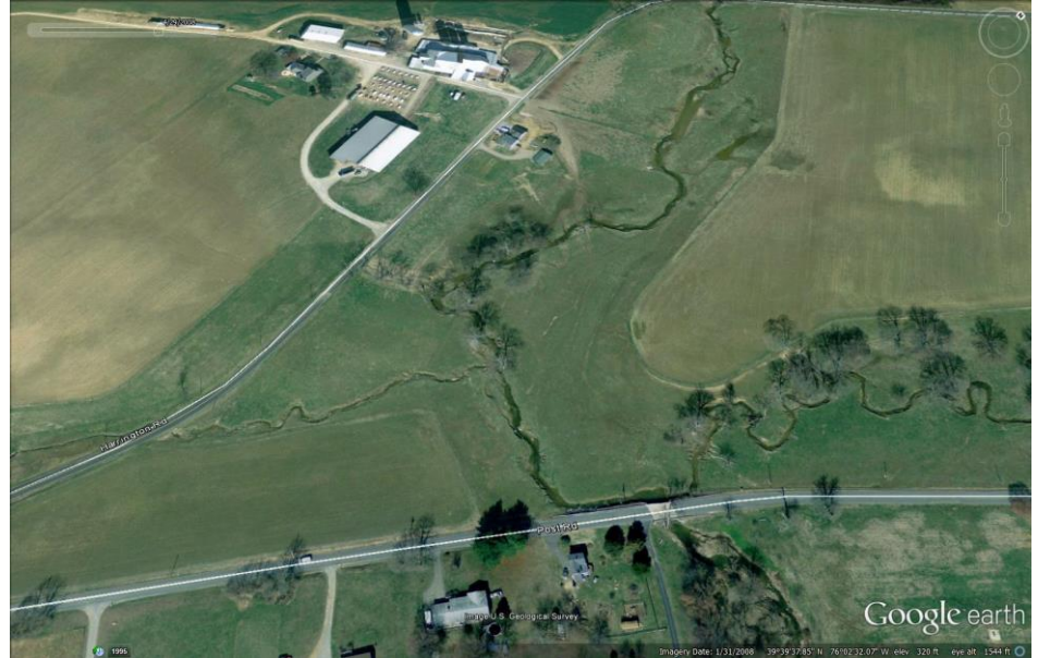
Horst Farm before restoration