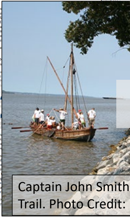
Captain John Smith Trail.