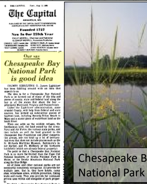
Chesapeake Bay National Park