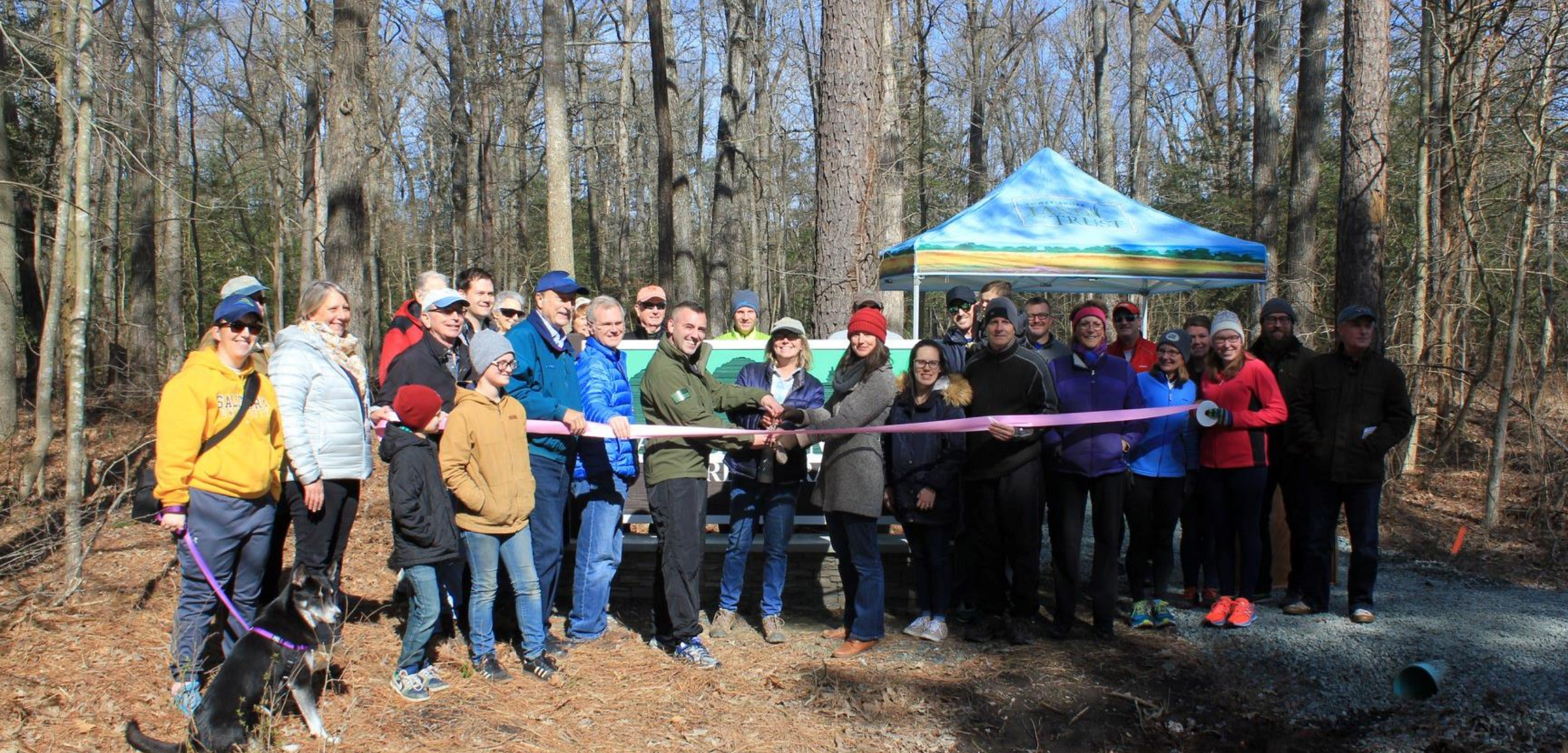
Naylor Mill Forest Trail Conservation Easement protects over 92 acres of Old Growth Forest! Special thanks to LSLT!